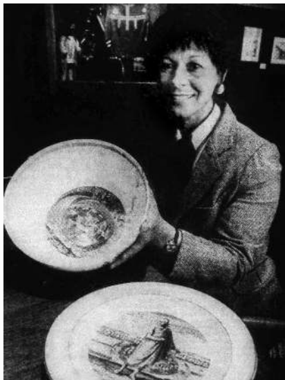
Figure 18 A Heritage Cast in Cherokee Clay, The Fayetteville Observer, 26 January 1986, newspaper article.