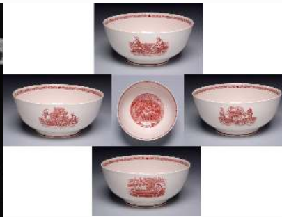
Figure 19 Wedgwood of Etruria & Barlaston, 400th Anniversary of America's Founding Bowl (composite image), 1985, queens ware ceramic, diameter 22.86 cm × height 10.2 cm. Collection of the North Carolina Museum of History, Raleigh, North Carolina (H.2006.23.200).